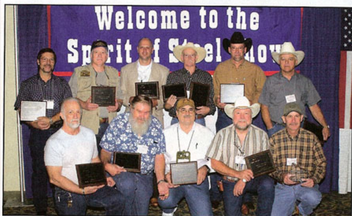
One knife from each of these makers would be a fantastic mini collection.