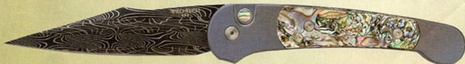
FULL CUSTOM TITANIUM FRAME, MOSAIC ABALONE INLAYS, R. EGGERLING DAMASCUS $1,000