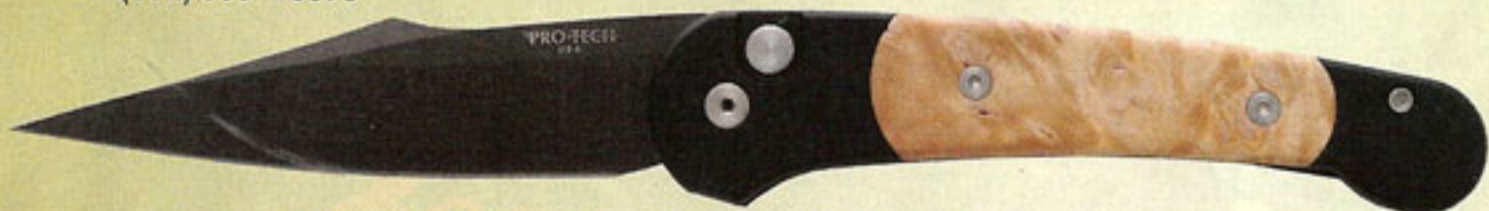
MONACO MAPLE BURL MODEL # 507 $300

MONACO AUTOMATIC KNIFE SUPERIOR STYLE AND QUALITY . . . MADE IN AMERICA