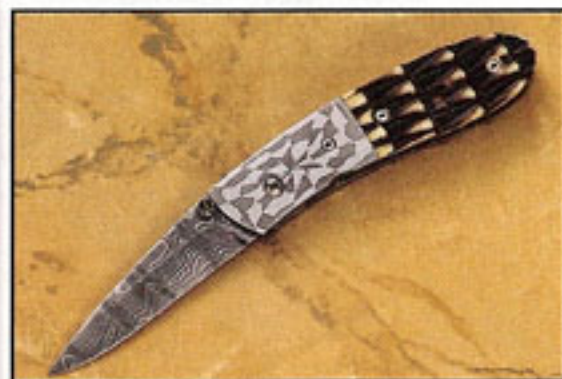
Don Hethcocat's locking liner is a flowing combination of two styles of Damascus and carved-ivory handles. It took home Most Innovative Knife.