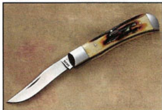
Wesley Davis makes a clean, tight version of the traditional stag-handled trapper.