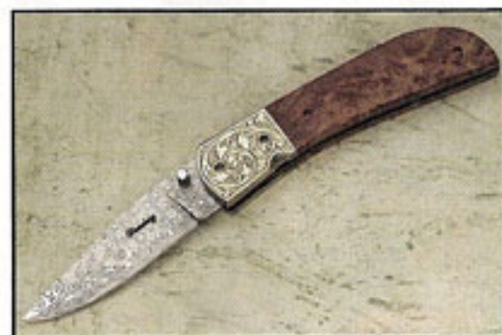
Chuck Dominy created this folder with raindrop Damascus, wood handle and engraved bolsters.