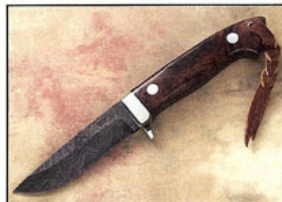
Keith Murr combines simple and clean with sharp execution to produce an eye-catching hunter.