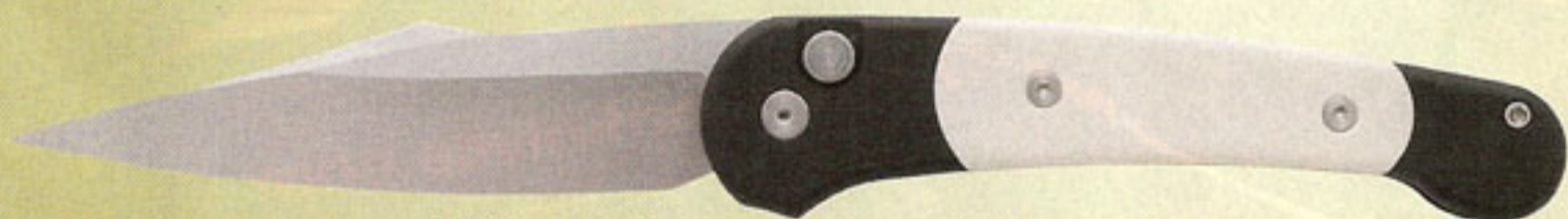
MONACO TUXEDO MODEL 551 $300