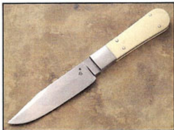
Jim Crowell's distinctive shooting-star logo adorns this simple, yet elegant, ivory hunter; it won Best Fixed Blade.